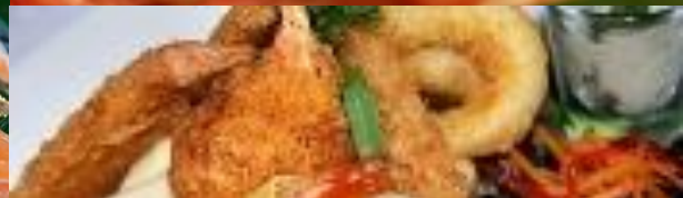
Decorative imagery; not necessarily actual dishes